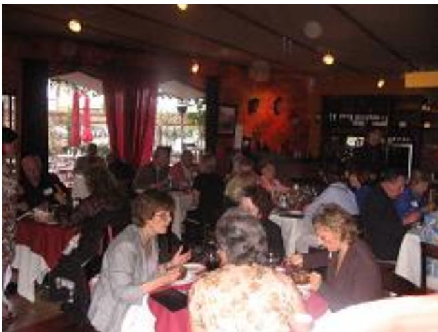
Members enjoy a 3 course dinner at Leana Bistro

To celebrate the French holiday of Bastille Day, the San Diego World Affairs Council hosted a French Cultural Dinner at the lovely French Pastry Shop and Leana Bistro. Guests were treated to a traditional dinner of Soupe A